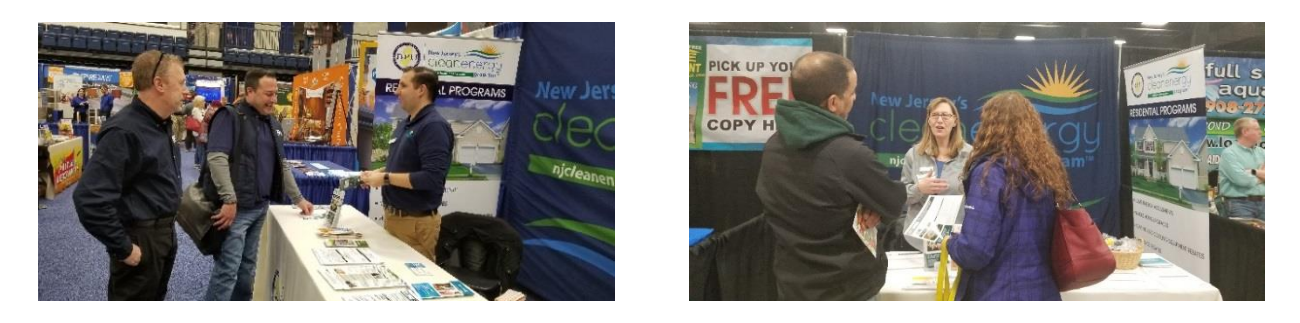
The Outreach Team promotes NJCEP programs at the New Jersey Home Show